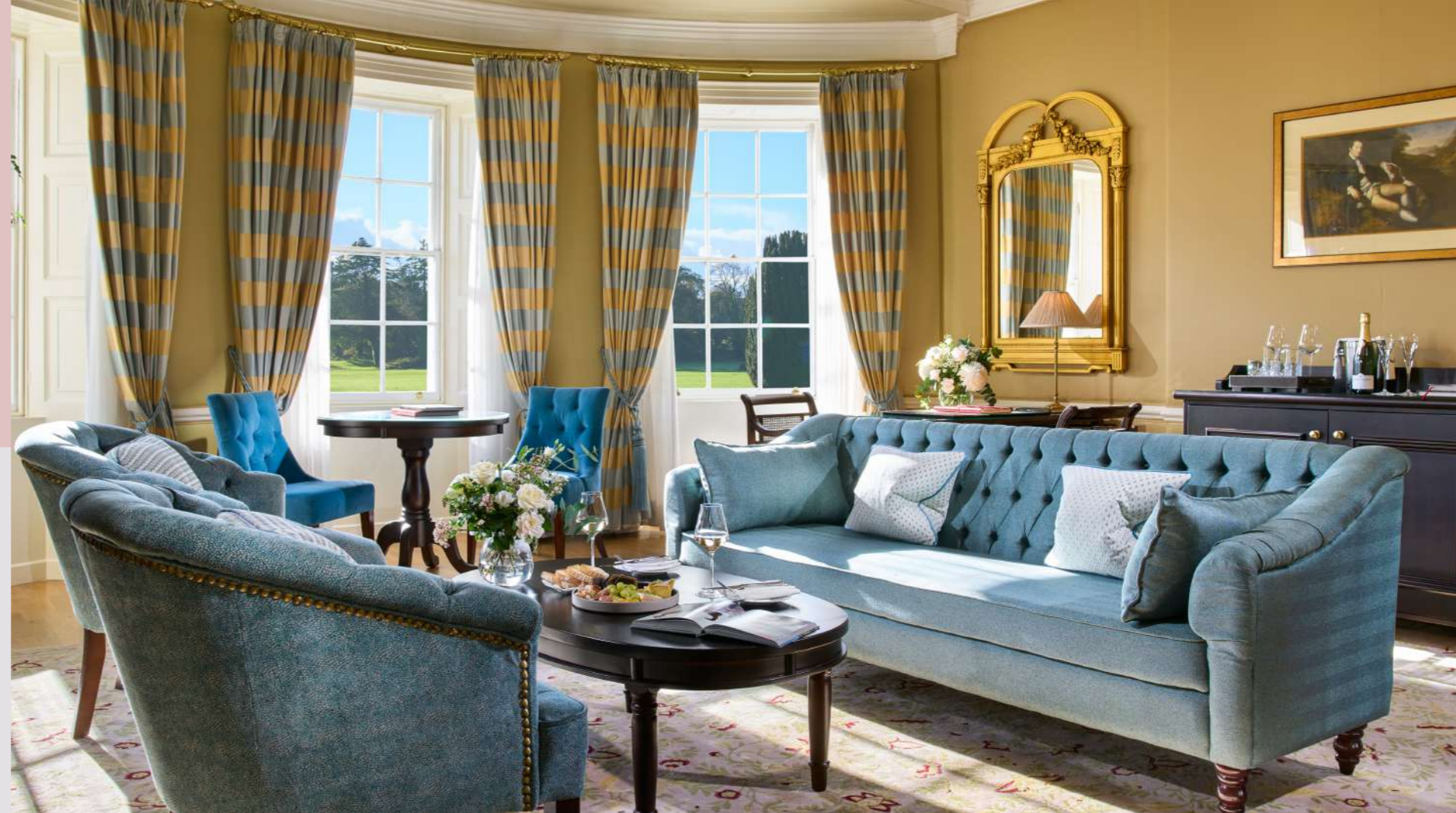
BRIDAL SUITE - offered with our compliments on your wedding night.*

Your elegant and contemporary accommodation will incorporate a sublime and spacious suite, classically decorated with king size bed, luxury lounge, dressing area and Italian marble bathroom.